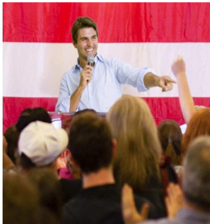
Above left, Sen. Bernie Sanders announces he is dropping out of the 2020 U.S. presidential race. Above right, actor Tom Cruise announces his candidacy for U.S. president at a rally at the Church of Scientology headquarters under the sea.