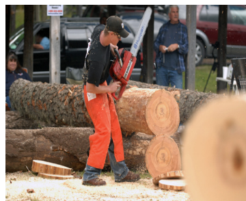
Above, an actual lumberjack, at any actual lumberjack class.