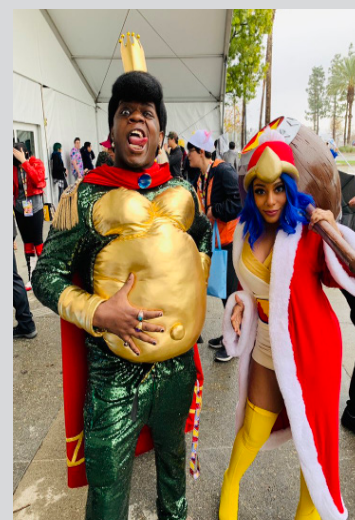
“King K. Rool” and “King Dedede” posing before turning on one another.

While these ceremonies were self-contained, they all had an intense fervor that could only be described as religious.